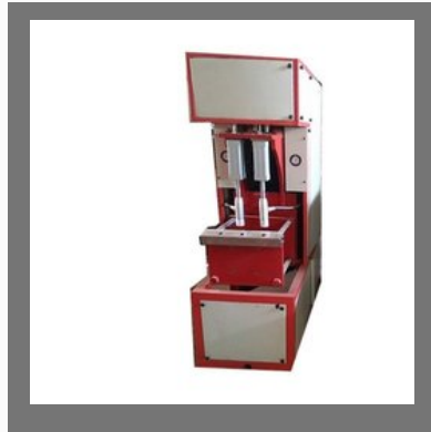
Water Bottle Making Machine