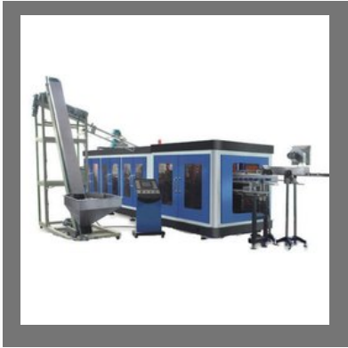
4 Cavity Fully Automatic Pet Stretch Blow Molding Machine