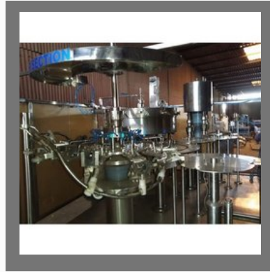
Food Oil Filling Machine