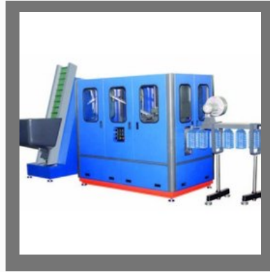
2 Cavity Pet Blow Machine