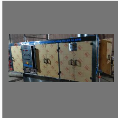
Carbonated Soft Drink Filling Machine