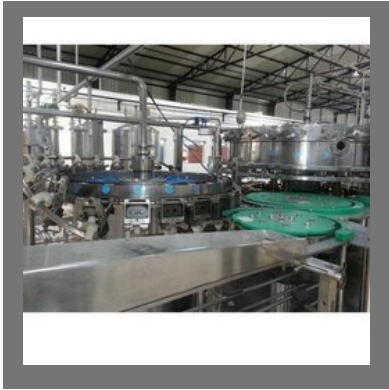
Soft Drink Making Machinery