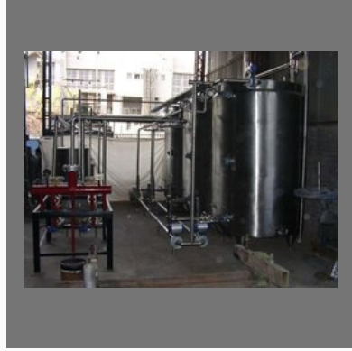
Automatic CIP System