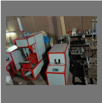
Pet Bottle Machine