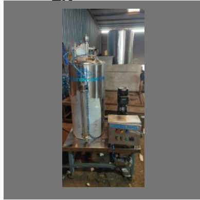
Carbonator Soft Drink Plant