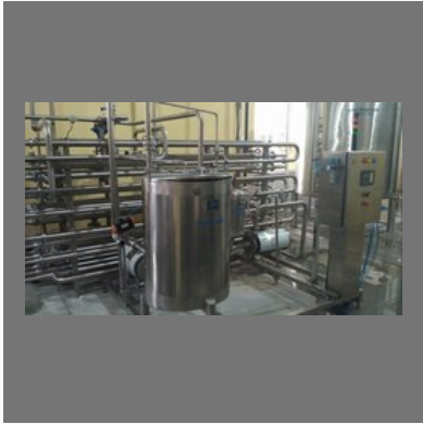
Pasteurizer (Tube&Tube System)