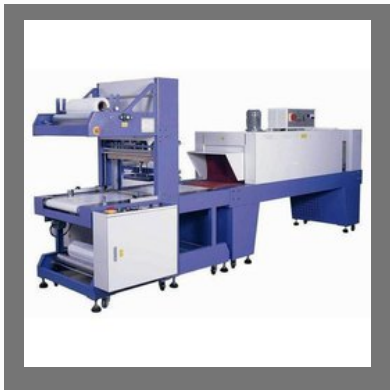
Automatic Shrink Wrapping Machine