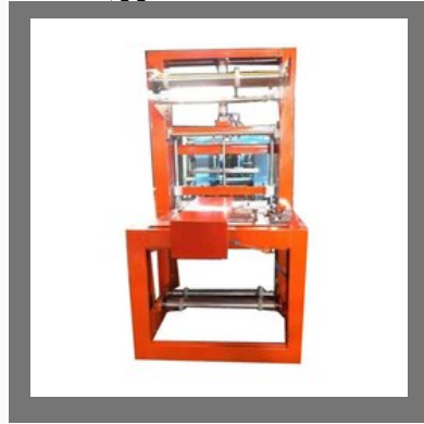
Semi Automatic Shrink Wrapping Machine