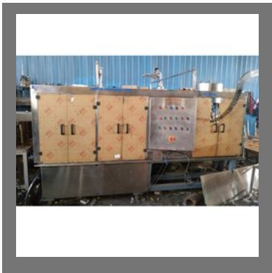
Juice Filling Machine