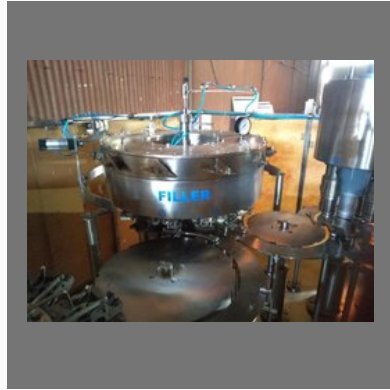
Mustard Oil Filling Machine