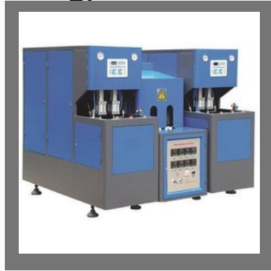
Semi-Automatic PET Blow Moulding Machine