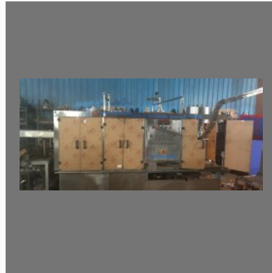
Hot Juice Filling Machine