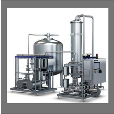
Premix Buffer Soft Drink Carbonator Plant