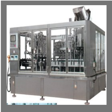
Carbonated Soft Drink Filling Machine