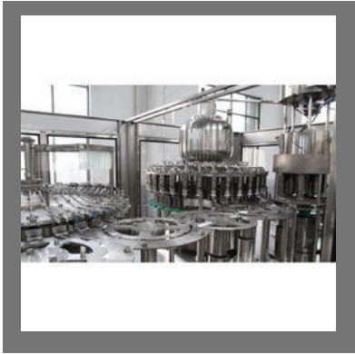
Packaged Drinking Water Bottle Filling Machine