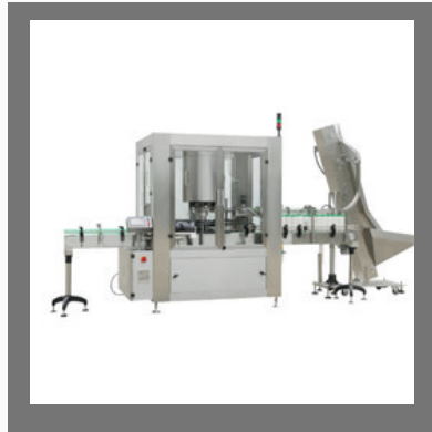
Rotary Capping Machines