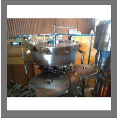
Automatic Liquid Filling Machine