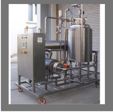
Semi automatic CIP system