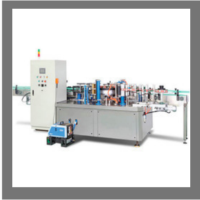
Bottle Labeling Machine