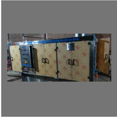
Beverage Processing Equipment