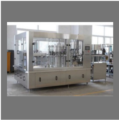
40 BPM Carbonated Soft Drink Filling Machine