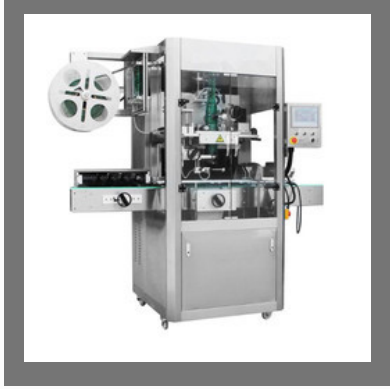
Neck Shrink Sleeve Applicator