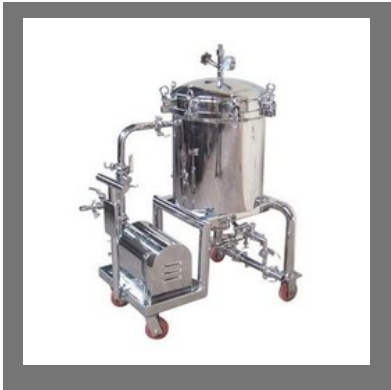
Sugar Filter Press