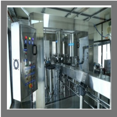
20 BPM Rinsing, Filling and Capping Plant