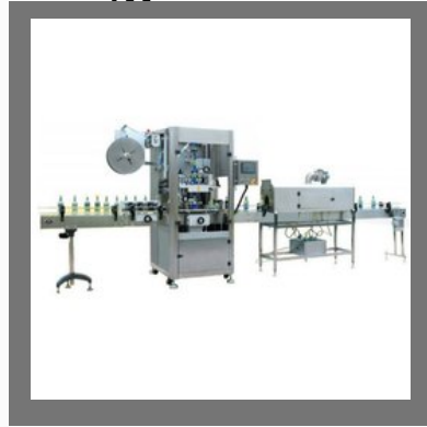
Shrink Sleeve Bottle Labelling Machine