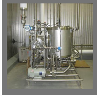
Single Tank CIP System