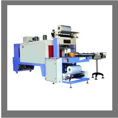
Shrink Wrapping Machine