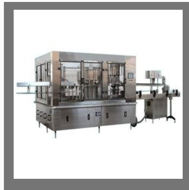
Mineral Water Bottle Filling Machine