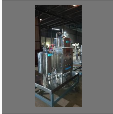
Buffer Carbonator System