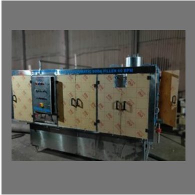
Automatic Soda Making machine