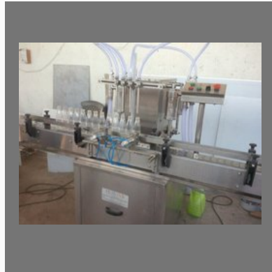
Mango Juice Filling Machine