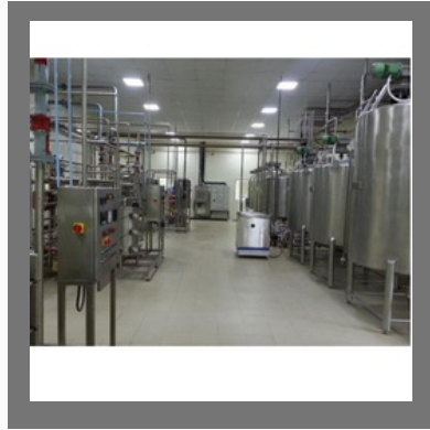
Carbonated Soft Drink Plant